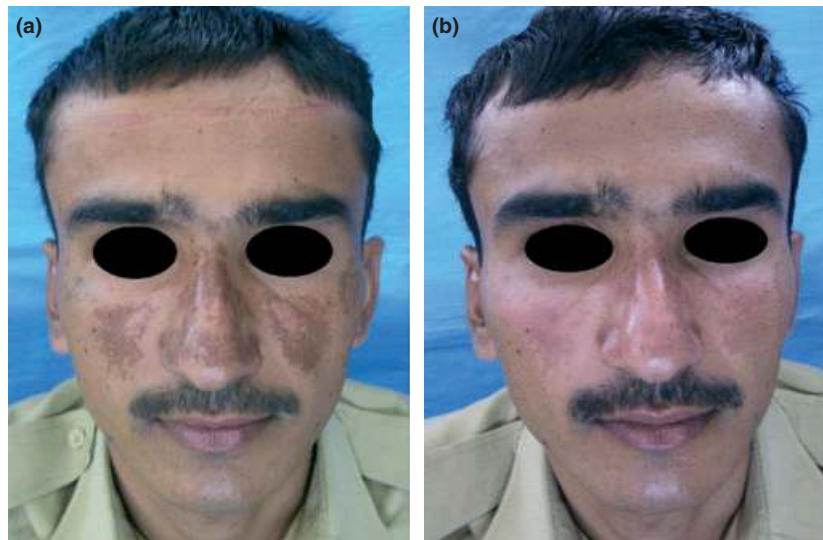
Figure 2 Pretreatment (a) and post-treatment (b) result in mixed-type melasma. Rated score 4 by an independent observer