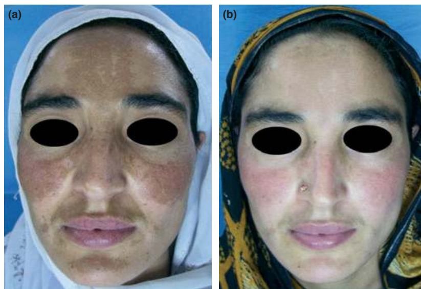
Figure 3 Pretreatment (a) and post-treatment (b) result in mixed-type melasma. Rated score 4 by patient herself

different available modalities such as bleaching creams, chemical skin peeling, microdermabrasion, IPL, and QS Nd:YAG laser. The patients had not shown any appreciable improvement to treatments offered to them for at least six months; therefore, for the purpose of this study we treated them as one group of refractory melasma. Although epidermal melasma responds better to standard melasma therapy, the success rate could be quite variable. Some patients with melasma have hyperactive melanocytes, and topical agents may have limitations in inhibiting the melanogenesis in them. Moreover, a poor